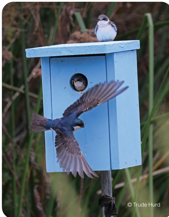
A parent tree swallow swoops in to feed fledglings at one of about 100 nest boxes at the marsh.

The marsh is one of Orange County's most popular birding spots. Visit IRWD.com/SanJoaquinMarsh .