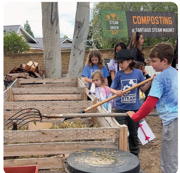
Pitchforks help students make light work of composting.

IRWD is happy to help schools in our service area get started on their own sustainable landscape projects. Email info@IRWD.com or call 949-453-5300.