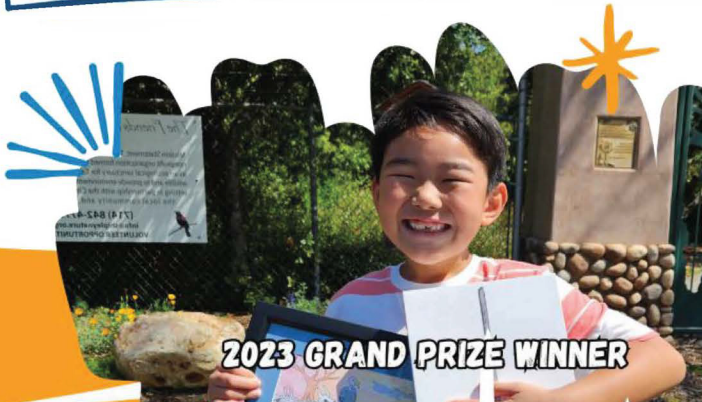
2023 GRAND PRIZE WINNER

Learn more at IRWD.com/postercontest Questions? Email CommunityRelations@IRWD.com .