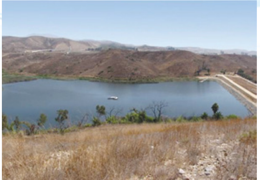
The IRWD Syphon Reservoir Recycled Water Project

Another upcoming project, which focuses on increased water reliability for south Orange County, is the proposed Baker