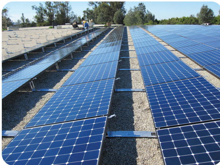
Installation of solar panels on IRWD's Zone 3 Reservoir

Renewable energy and other energy-saving projects are used throughout our service area, including solar power at our Baker Water Treatment Plant (1MW), at our Sand Canyon Headquarters (100kW), and our Zone 3 reservoir (250kW).