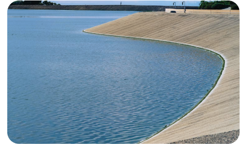
For more than 60 years, IRWD has safely owned, operated and maintained reservoirs and dams that store water for the benefit of the community. (Picture: San Joaquin Reservoir)

For more information on our Dam Safety Program, visit IRWD.com/dam-safety .